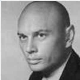
Yul Brynner (dec.), actor