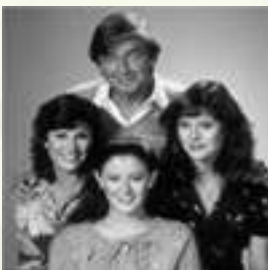
Kami Cotler , actress (youngest child on long-running series The Waltons)