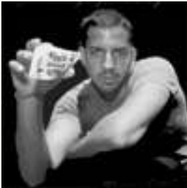
David Blaine , a magician as well as endurance artist and advocate of "street magic."