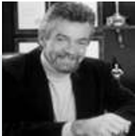
Stephen J. Cannell , TV writer-producer-director (The Rockford Files and many others)