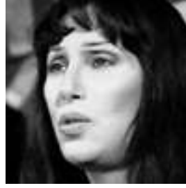
Cher Bono , singer-actress