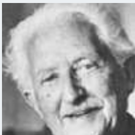
Erik Erikson (dec.), noted anthropologist/author, had a Montessori teaching certificate.