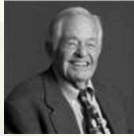
T. Berry Brazelton , noted pediatrician and author