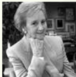
Katherine Graham (deceased), owner/editor of the Washington Post

Alice Waters , restaurateur and writer, is a former Montessori teacher