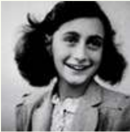
Anne Frank , famous diarist from world war II