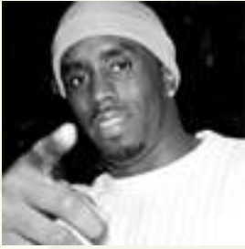
Sean 'P.Diddy' (formerly known as Puffy) Combs, RAP mega-star