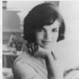
Jacqueline Bouvier Kennedy Onassis (deceased), editor, former first lady