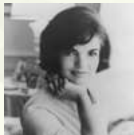
Jacqueline Bouvier Kennedy Onassis (deceased), editor, former first lady