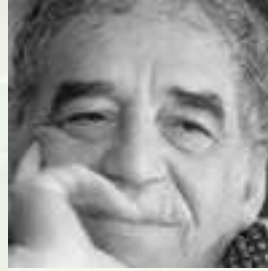
Gabriel Garcia Marquez , Nobel Prize winner for Literature