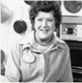
Julia Child , famous chef, star of many TV cooking shows and author of numerous cookbooks