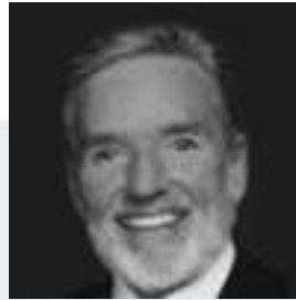
John Bradshaw , psychologist and author