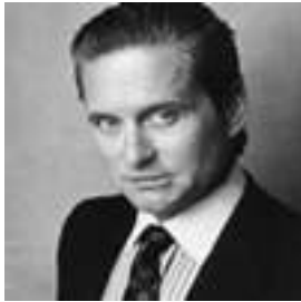
Hollywood actor, Michael Douglas ( A few movies he acted in Basic Instinct, Black Rain, Fatal Attraction)