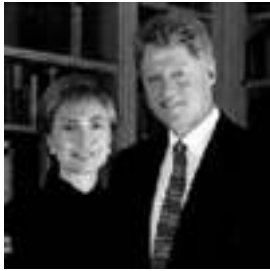
Bill & Hillary Clinton , former president/senator, NY