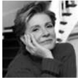
Patty Duke Austin , actress.