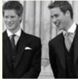
Prince William and Prince Harry , English royal family